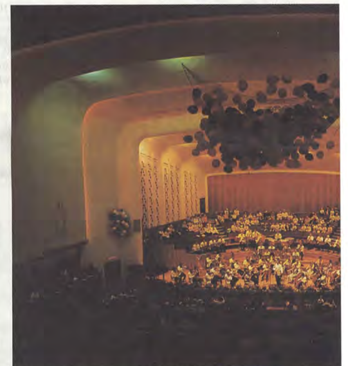
Hundreds of red, white and blue balloons are dropped in the Last Morning of the Proms concert.

On arrival at the Philharmonic Hall, the patriotic Manweb Prommers lucky enough