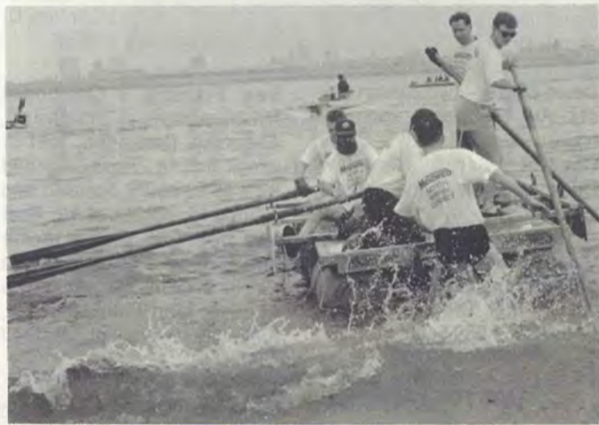
North Wirral's crew push the boat out!

IT was all hands to the oars when North Wirral 'launched' an entry for the annual Mersey raft race.