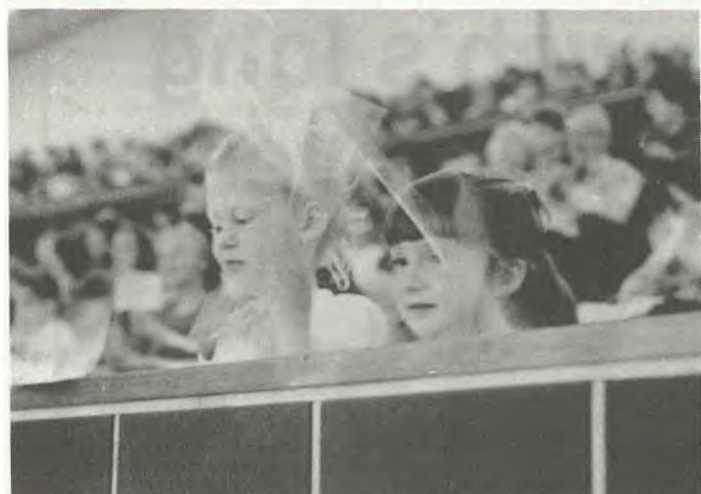
Flag-waving youngsters at the children's Last Morning of the Proms concert.

obtain tickets for the sell-out event, were given hats and