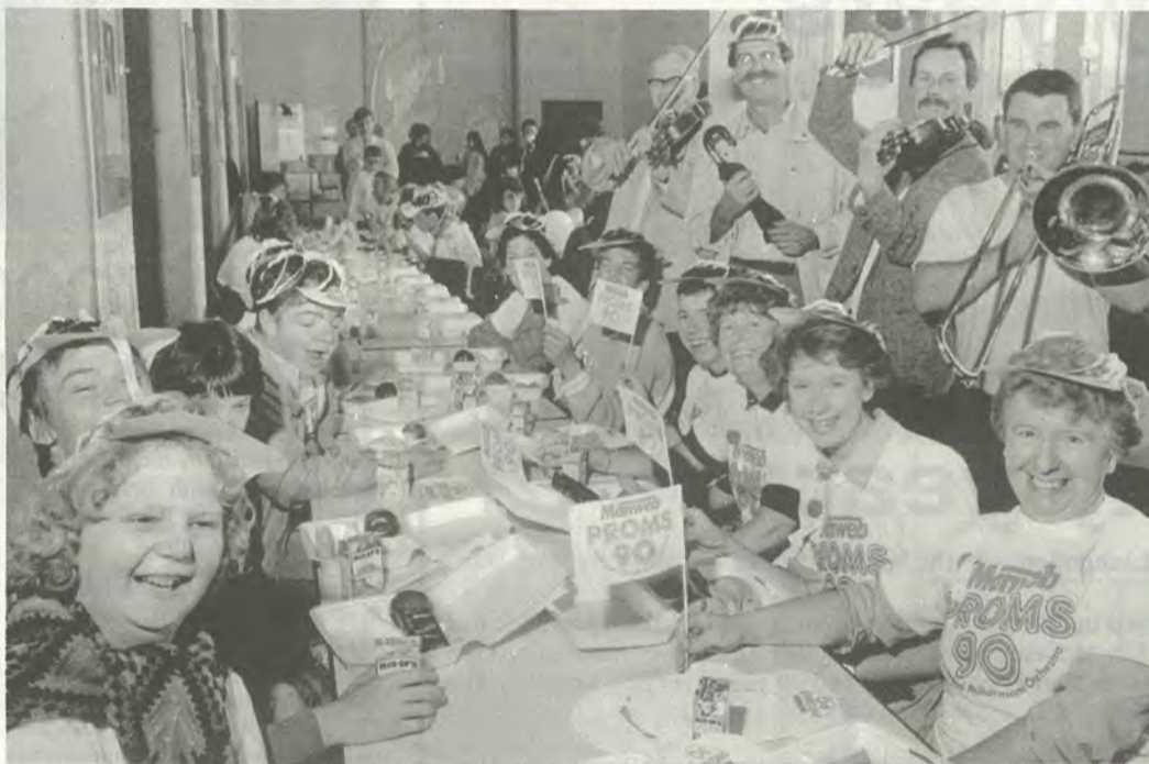
Children and helpers from Meadowside School, Pool Lane, Woodchurch, are entertained by members of the Liverpool Philharmonic Orchestra.

And Manweb gave each film-goer a packet of complimentary tissues to have a good cry!